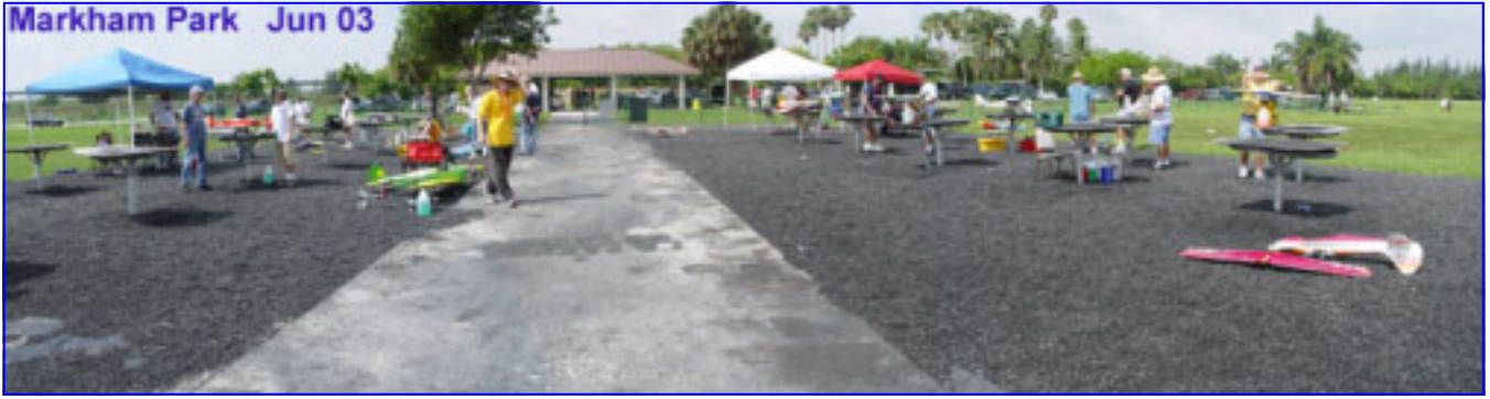
Markham Park Jun 03